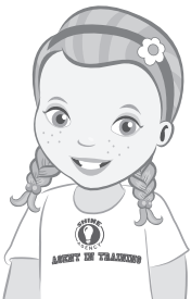
TRAINEE ID IMAGE